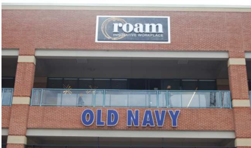
The Roam facility

Once again, we offer our sincere thanks to Peyton and Vicky Day for opening the excellent ROAM facility for us to use, and for the incredible support staff. We received many nice accolades; the ROAM seemed so comfortable and the attendees appreciated the program with very positive comments about the speakers and the presentations. ( "Excellent presenters! Dynamic speakers! Most interesting! Overall program was awesome, thanks! Conference was exceptional! Really enjoyed the patient stories!" )