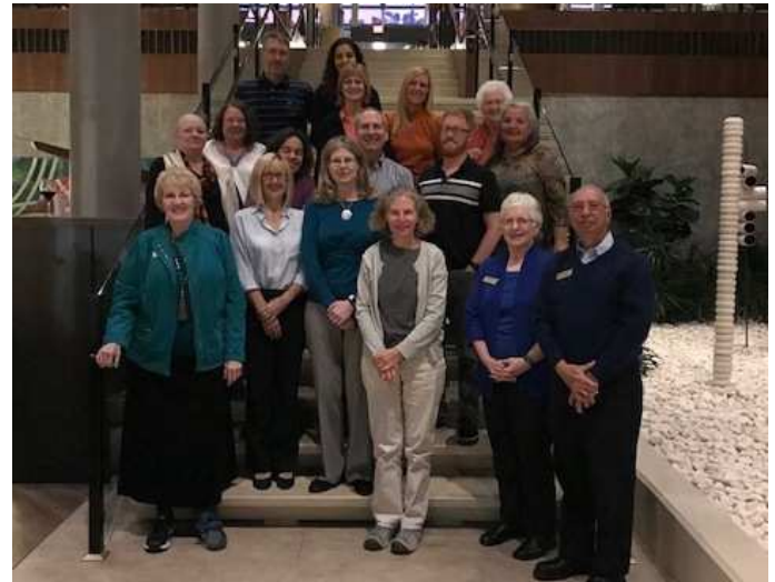
Attendees at our Friday night speakers' dinner