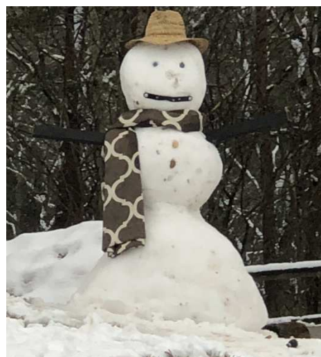
We also appreciate all our LLN attendees who came out on a snowy day in Georgia!